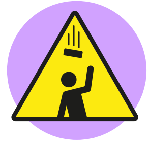
Falling or moving objects