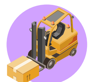
Operating machinery and equipment