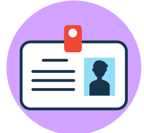
Working in someone else's home or premises