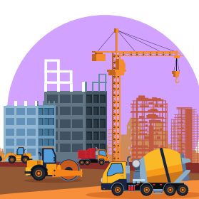
Driving and working around vehicles