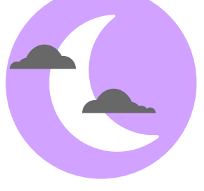
Working during darker hours or in low visibility