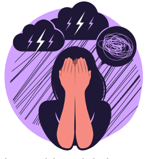
Mental health issues, through abuse or loneliness