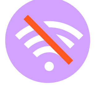
Areas with poor phone or wifi signal