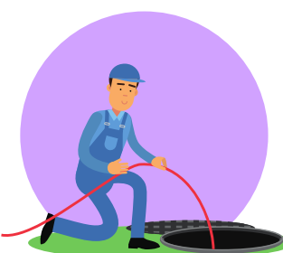
Working in confined spaces