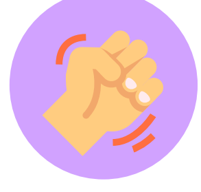
Verbal and physical abuse