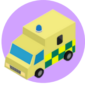
Accidents arising out of work