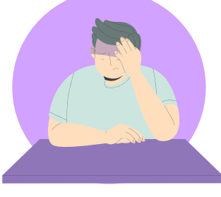
Inadequate provision of rest (fatigue)