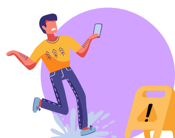
Slips, trips and falls