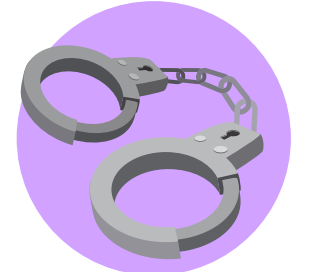
Working in areas known for crime or anti-social behaviour