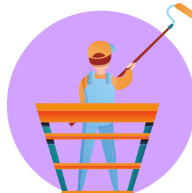
Working at height

Occupational risks are any risks that arise from different workplace activities and environments. Occupational risk factors could include: