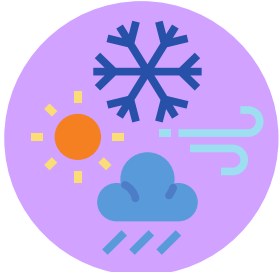
Severe weather (hot, cold or stormy conditions)

Environmental risks are any risks that arise from different working environments. Environmental risk factors could include: