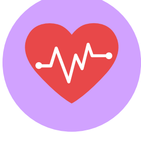
Sudden illness and pre-existing medical conditions

Personal risks are any risks that are created through an individual or another human being. Personal risk factors could include: