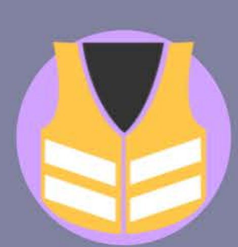
High visibility clothing