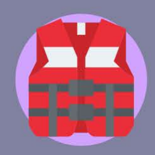
Other safety equipment, such as life jackets